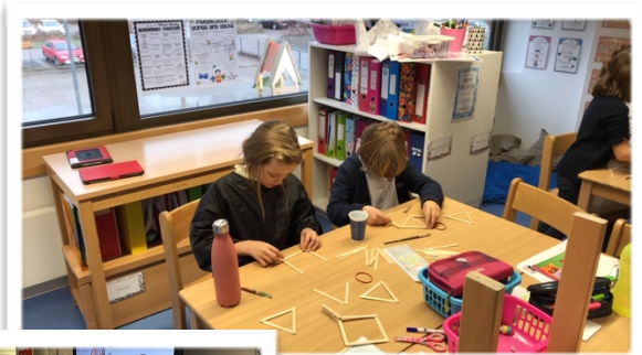
Our Year 3 classes created bridge constructions.