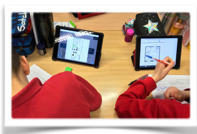
Year 4 are currently designing their own houses - a very realistic task, thanks to the iPads!